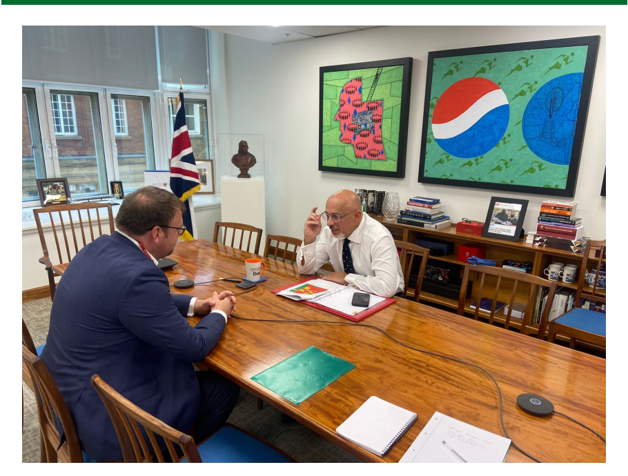
Presenting my report on post-16 education

I promised to keep pushing for our young people to have better access to the education they deserve.